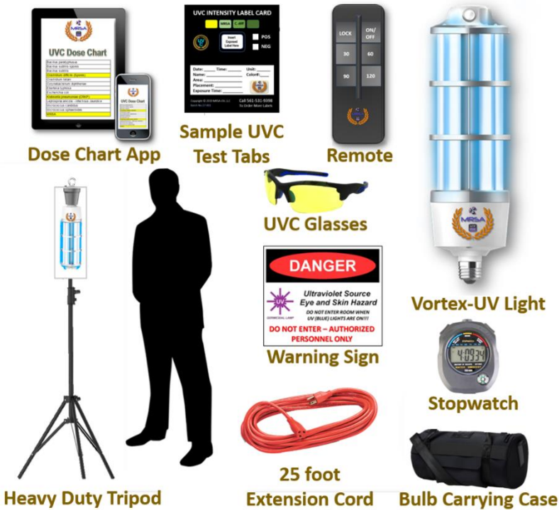
Heavy Duty Tripod