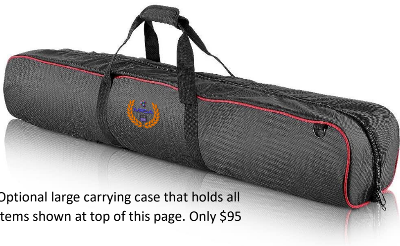
Optional large carrying case that holds all items shown at top of this page. Only $95