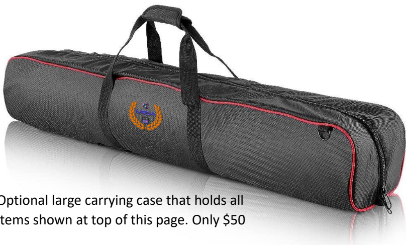
Optional large carrying case that holds all items shown at top of this page. Only $50